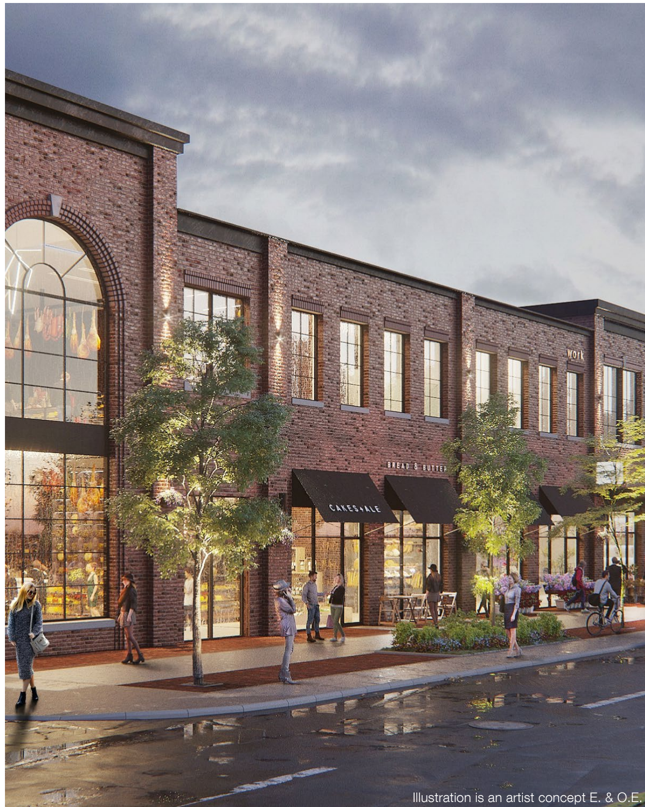
Illustration is an artist concept E. & O.E.