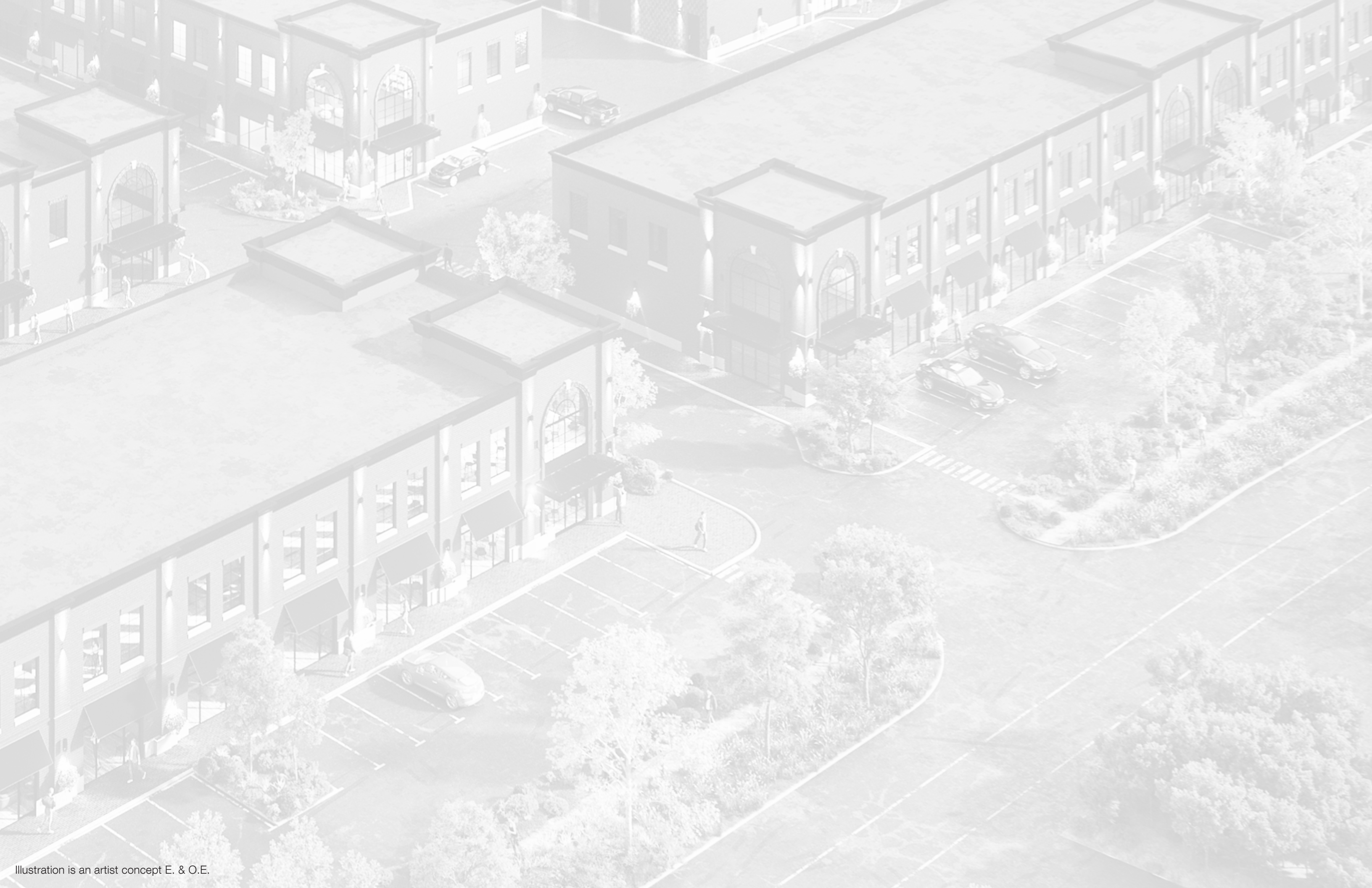
Illustration is an artist concept E. & O.E.