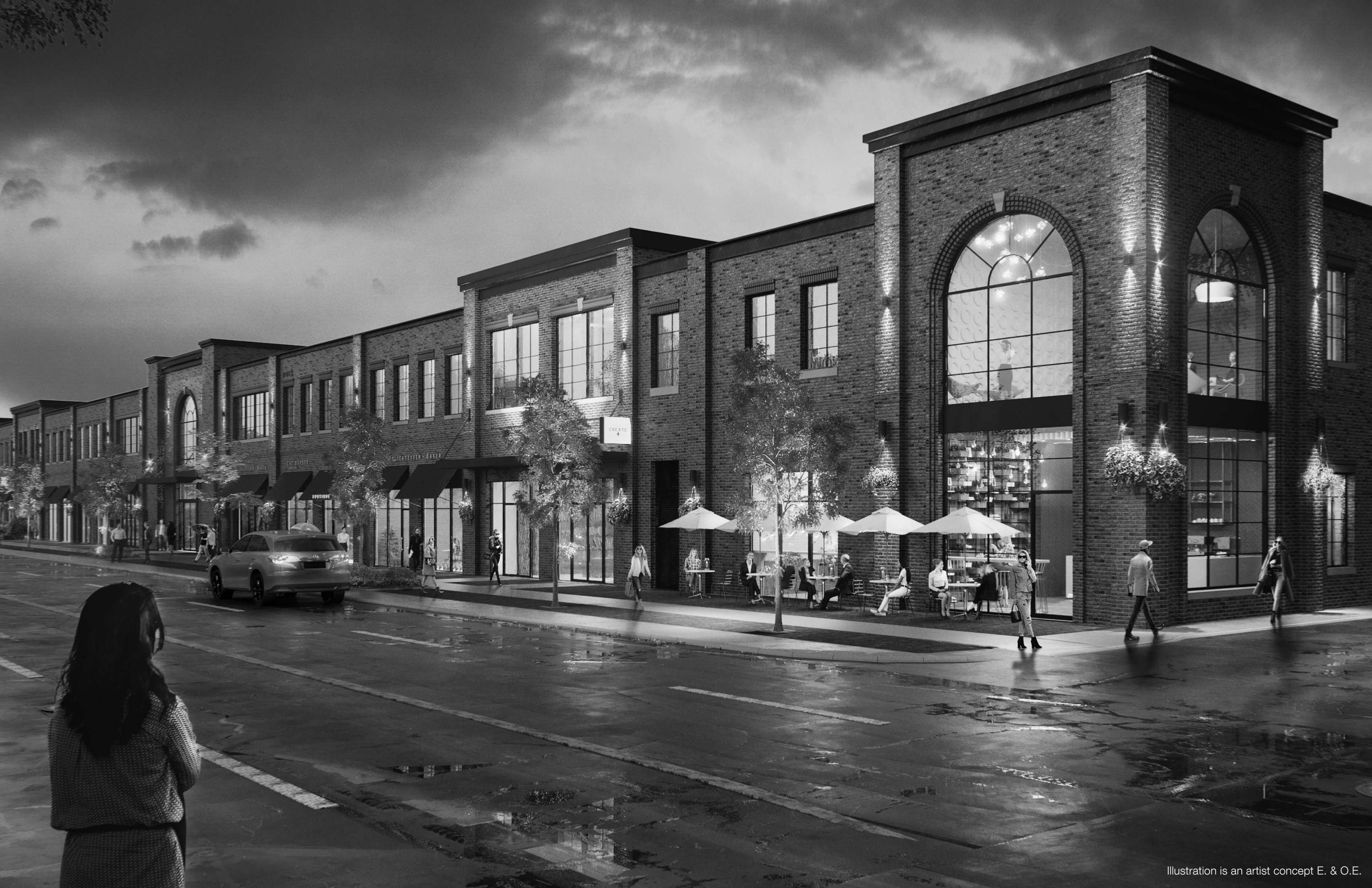
Illustration is an artist concept E. & O.E.