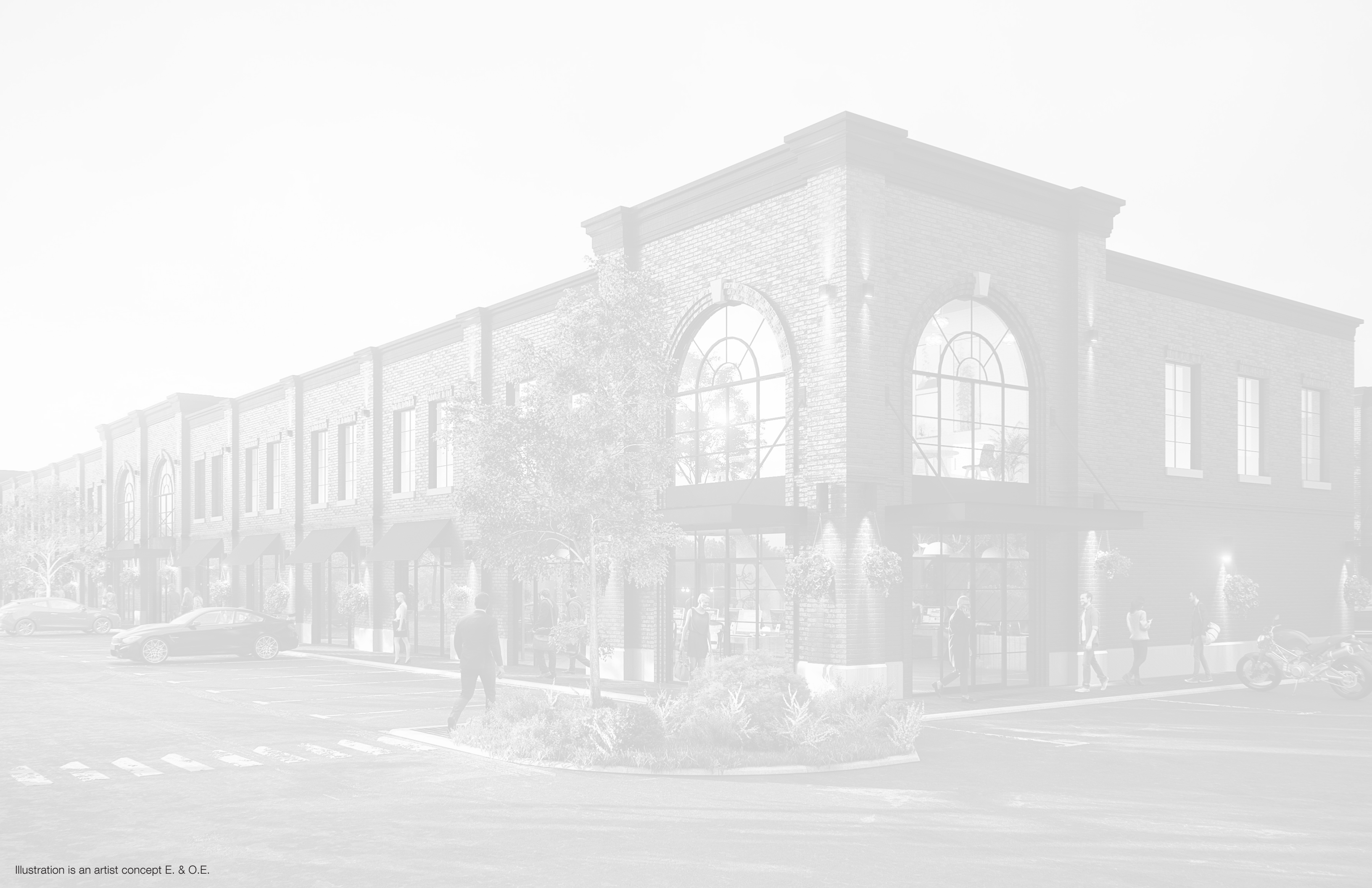
Illustration is an artist concept E. & O.E.